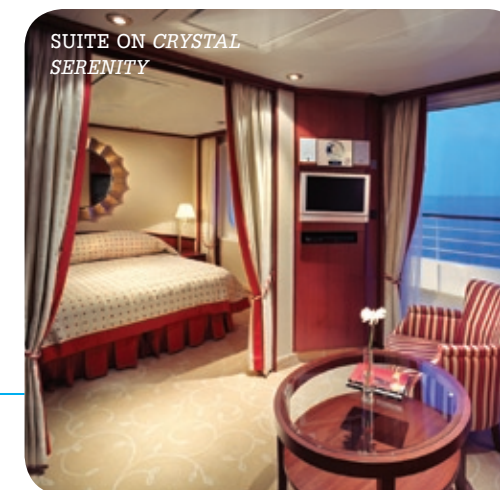
SUITE ON CRYSTAL SERENITY