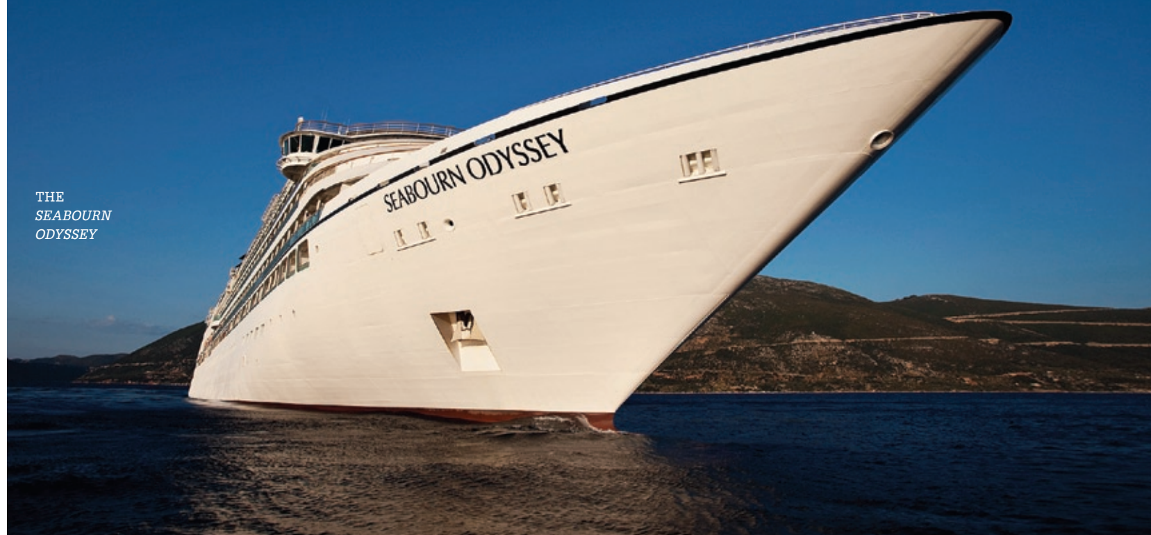
THE SEABOURN ODYSSEY