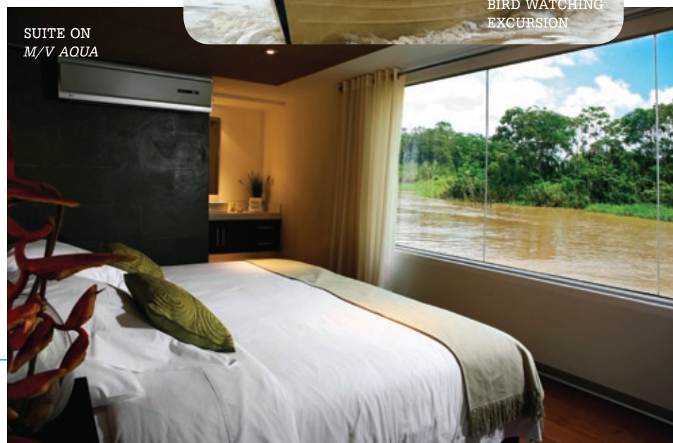
SUITE ON M/V AQUA