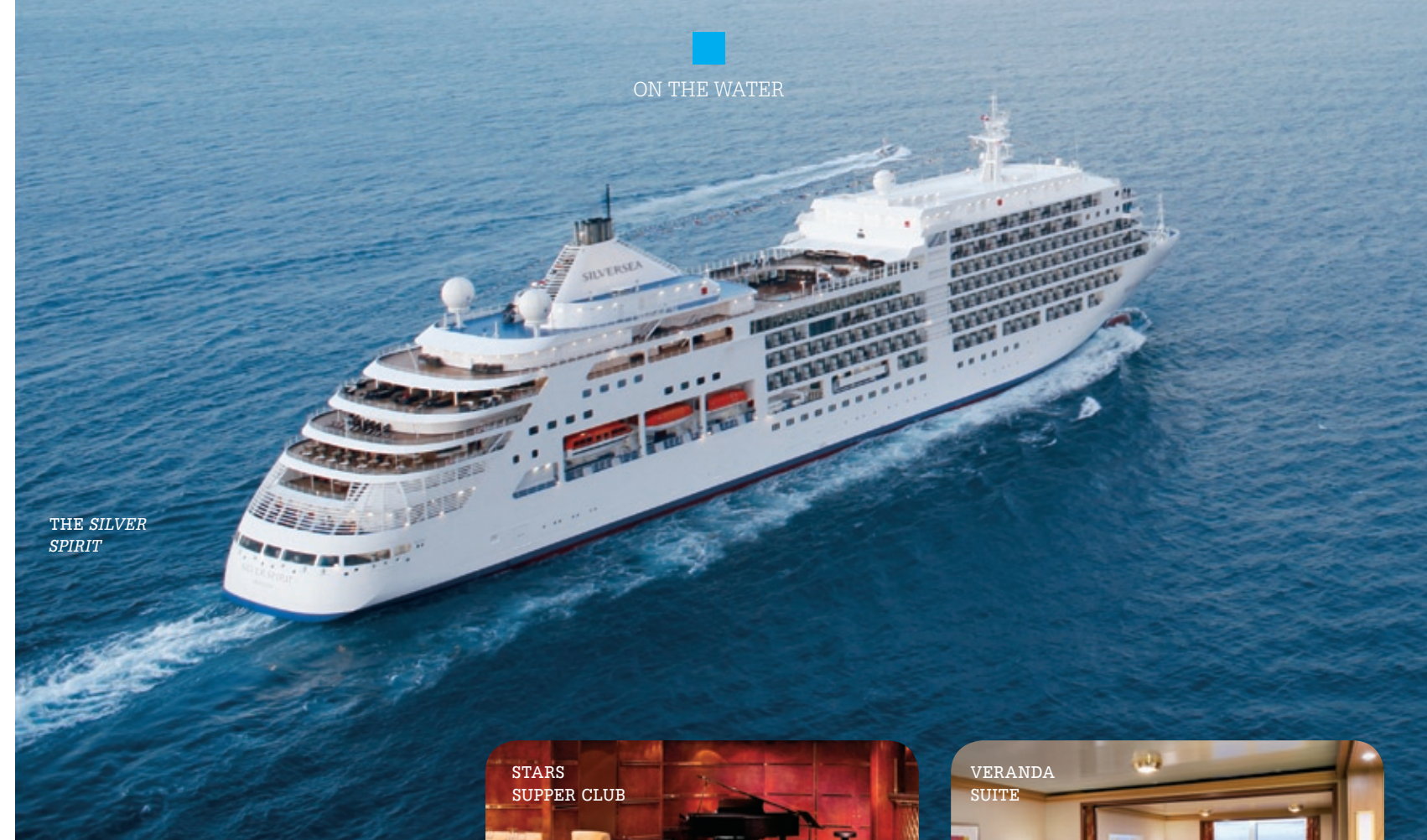
THE SILVER SPIRIT