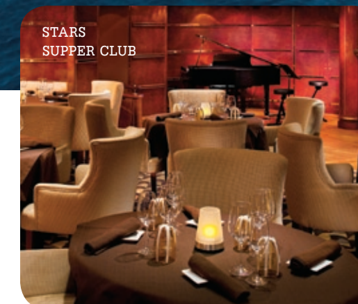
STARS SUPPER CLUB

Ocean view suites range in size from 312 square feet to 1,668 square feet, and all but