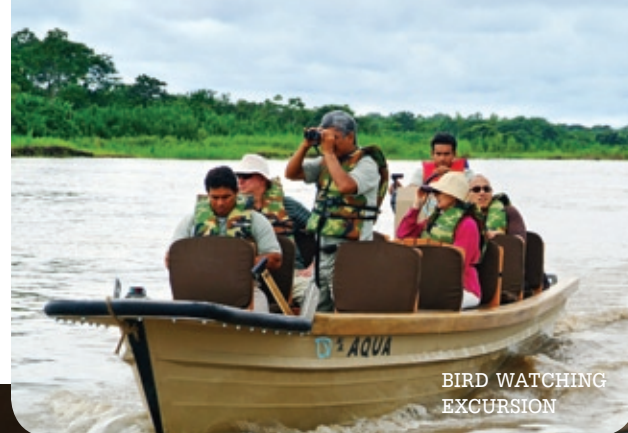
BIRD WATCHING EXCURSION