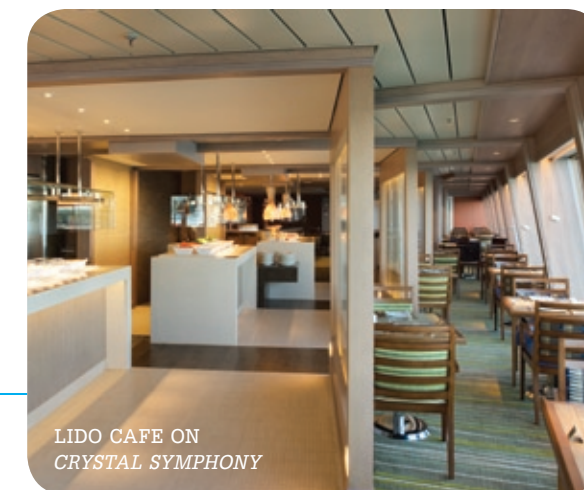
LIDO CAFE ON CRYSTAL SYMPHONY