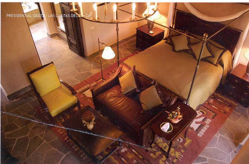
PRESIDENTIAL CASITA / LAS CASITAS DEL COLCA