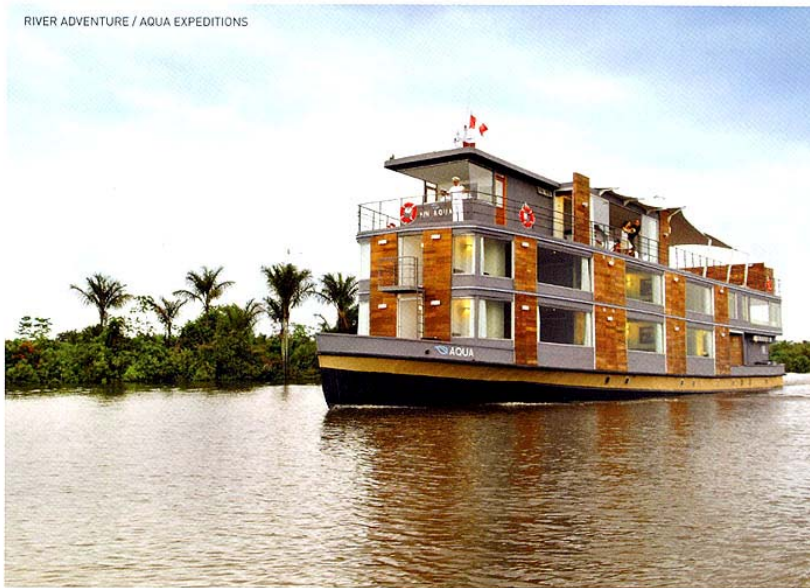
RIVER ADVENTURE / AQUA EXPEDITIONS