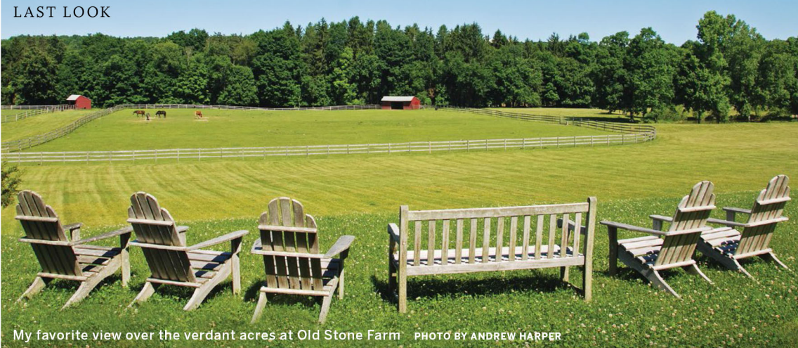
My favorite view over the verdant acres at Old Stone Farm

📷 = slideshow 📺 = video 🔍 = additional stories