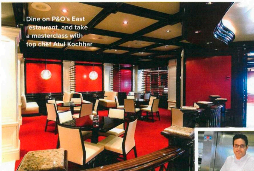
Dine on P&O's East restaurant, and take a masterclass with top chef Atul Kochhar