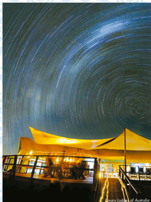
Luxury Lodges of Australia

Luxury travel is a lucrative sales proposition so it's crucial to stay on top of the latest trends. Tara Harrison presents next year's top eight