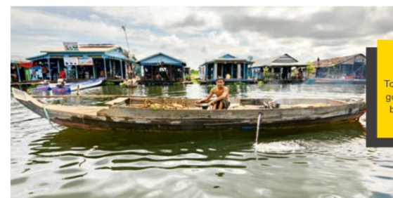
LIVING ON THE LAKE Tonle Sap residents go about their daily business via their wooden boats