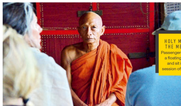
HOLY MEN OF THE MEKONG Passengers can visit a floating temple and sit in for a session of chanting

As with the company’s two ships on the Amazon, Aqua Mekong is all about exploring beyond familiar seascapes, and its four skiffs offer a better chance than any other vessel on the lake to delve deeper into nature reserves and isolated fishing communities. So it is on our first morning as we glide through the still waters of the 31,282ha Prek Toal Bird Sanctuary, a fundamental component of the UNESCO-recognised Tonle Sap Biosphere Reserve, which encompasses Cambodia’s Great Lake. In the shade of the skiff’s canopy, armed with long lenses and Aqua thermoses – one of the company’s many real-world green initiatives – my 26 fellow passengers and a clutch of well-trained guides keep a sharp vigil for migratory birds like the great egret and Indian shag. Perched atop trees slowly dying from their guano, Oriental darters parade before us, their outstretched wings drying in the sun, while squadrons of giant pelicans patrol above, their