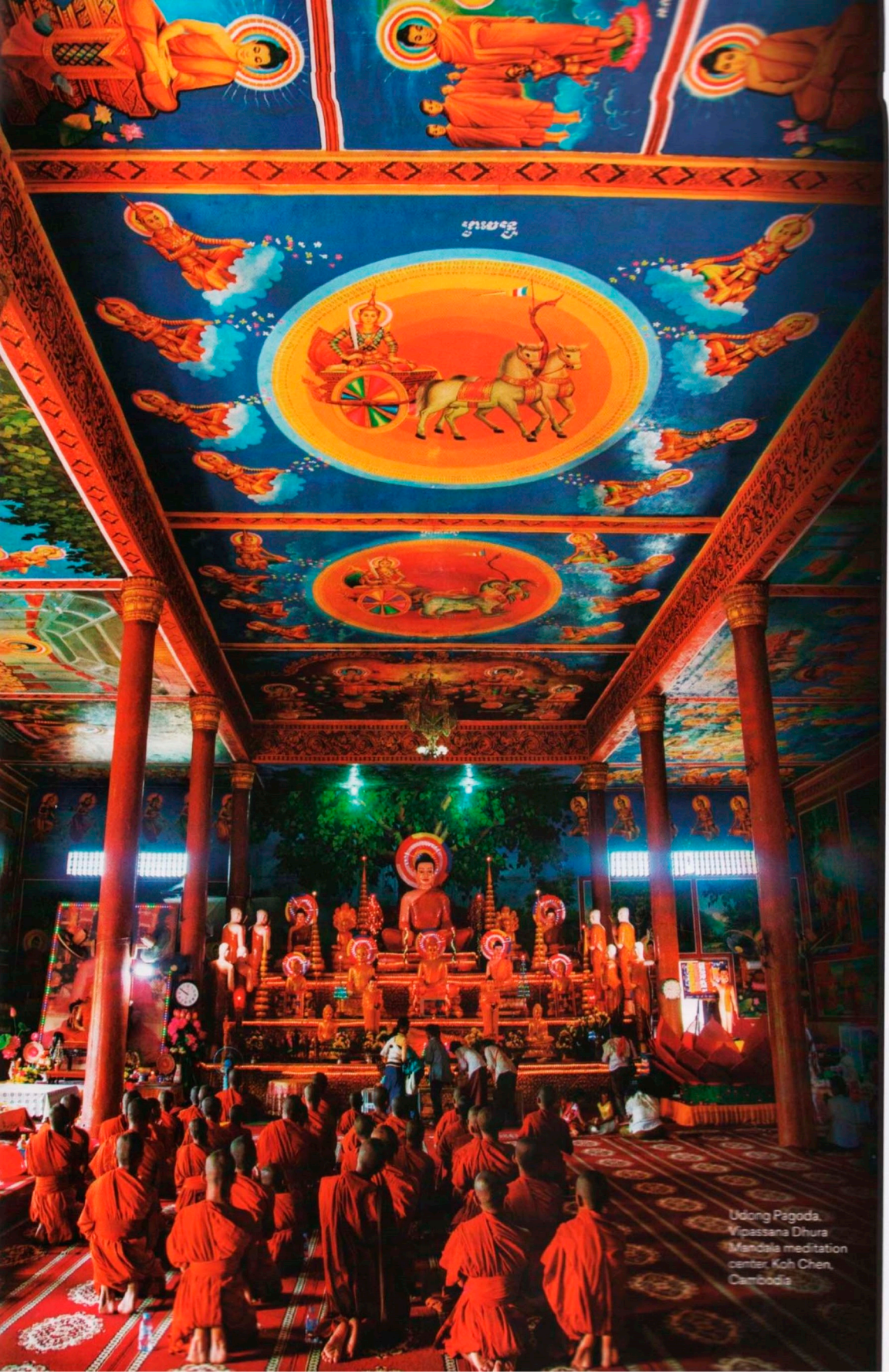
Udong Pagoda, Vipassana Dhura Mandala meditation center, Koh Chen, Cambodia