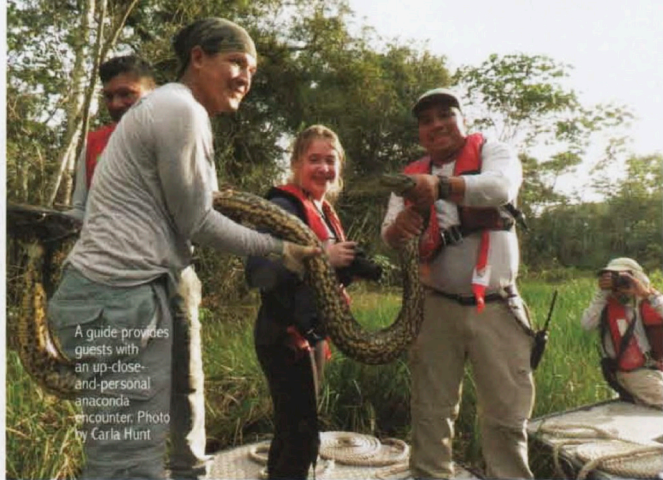
A guide provides guests with an up-close-and-personal anaconda encounter.