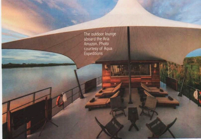
The outdoor lounge aboard the Aria Amazon.