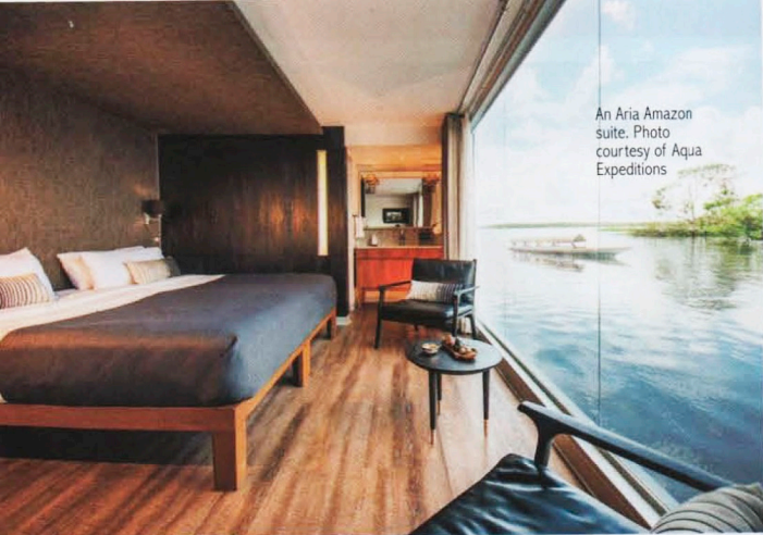
An Aria Amazon suite.