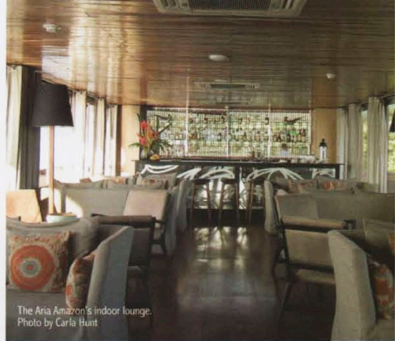
The Aria Amazon's indoor lounge.

projects in Amazonia. Guests may also participate in cooking demonstrations and learn how to fold towels and napkins into animals and flowers. Additionally, they can make use of the small exercise room, enjoy a massage in the spa, read in the handsome bar/indoor lounge or laze on the sundeck with a cool pisco sour in hand.